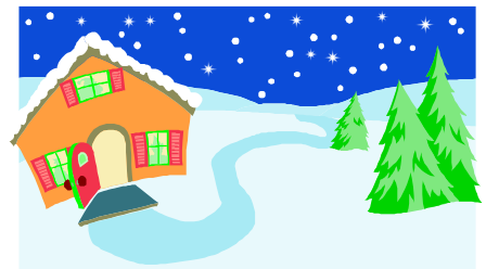
Make sure your heating equipment is working to its top level of performance and efficiency.

The projected increases in fuel cost are all the more reason to make sure that your heating equipment is working to its top level of perform-