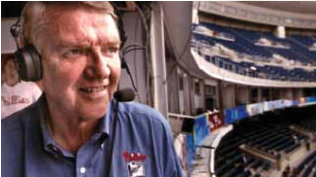
Harry Kalas - 1936-2009.

"It's a long, fly ball and..... it's outtttaa here." So long Harry.